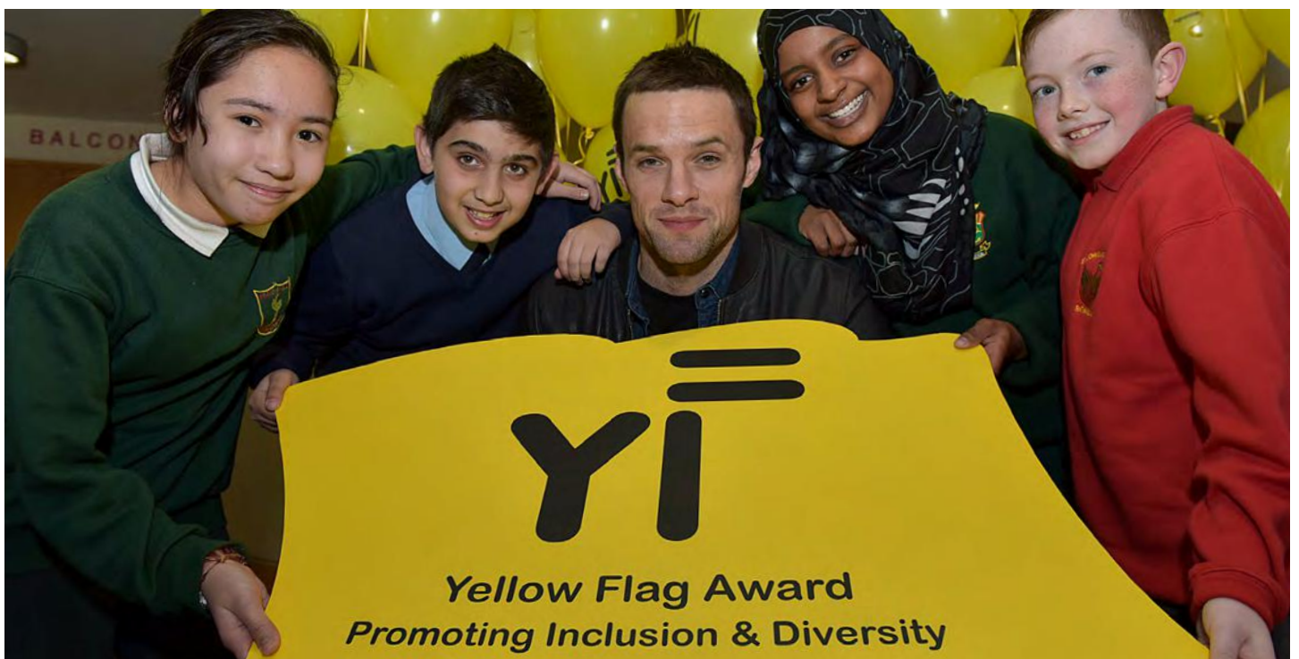
Students with Bressie at the Yellow Flag Awards 2016